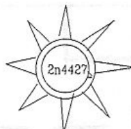
Shown with heatsink on